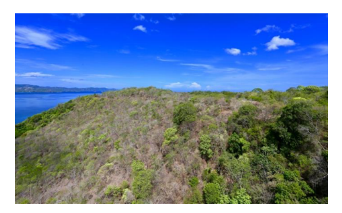
Sloped terrain ideal for terraced lots