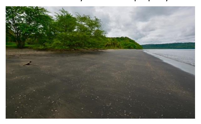
Calm & serene Playa Manzanillo