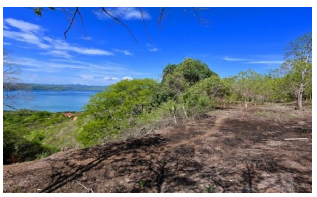
Flat building area at highest elevation