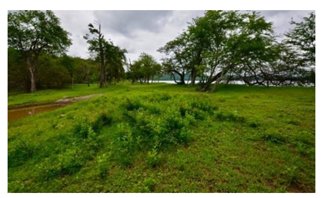
Beach access only 200m from property