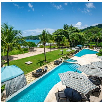
2 pools & private Cabanas