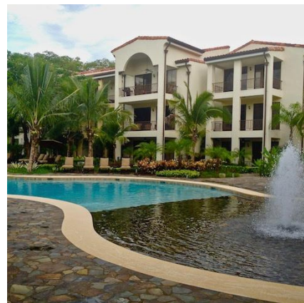
4 Community Pools