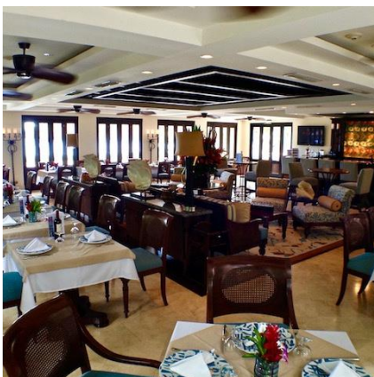
Dining room at Beach Club