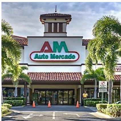
Supermarket & Retail Shops