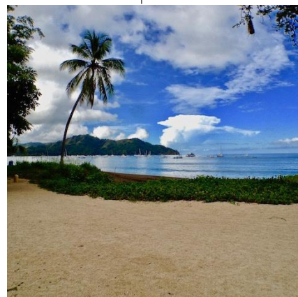
Free shuttle from Development