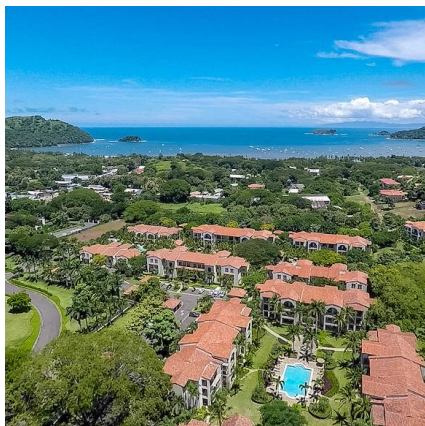
Walk to the beach!