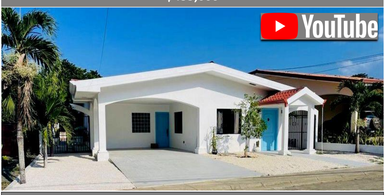
Mossey Rock #3-3 Bedroom-3 Bath-Total 1630 Sq/ft-Fully Renovated-Playas del Coco-$435,000

3 Bedrooms-3 Bathrooms-Total 1630 Sq/ft-Fully Renovated-Furnished Playas del Coco-Costa Rica $435,000